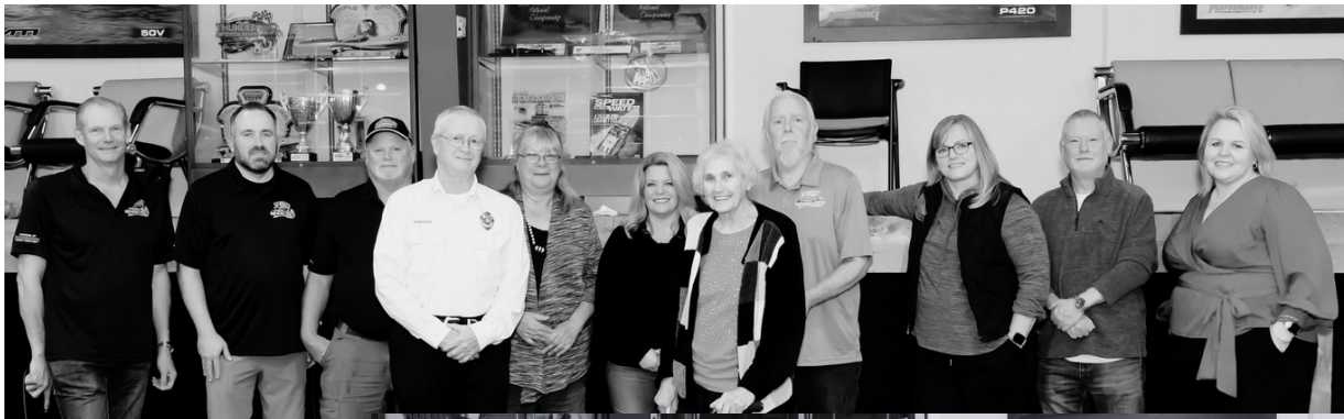
Pictured Left: Representatives for the Coffman Bend Fire Protection District & Shootout Board Members