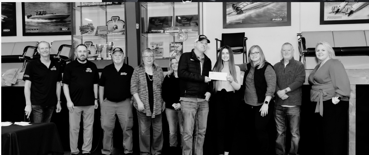
Pictured Left: Representatives for The Changing Table & Shootout Board Members